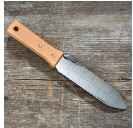
Japanese Hori Hori Knife used for digging weeds and cutting apart roots in the soil