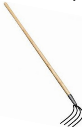
Potato Fork for raking soil and helping harvest potatoes