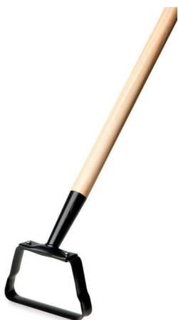
Hula Hoe or Stirrup Hoe for removing surface weeds