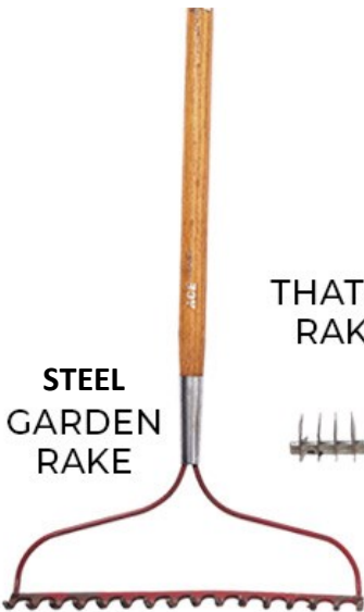
Steel Garden Rake for raking soil & gravel