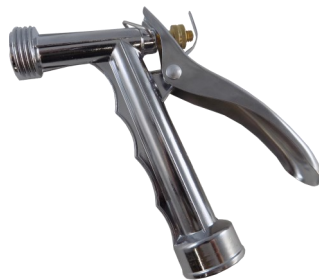
Spray Nozzle for watering with adjustable spray patterns, turn off hose when not in use