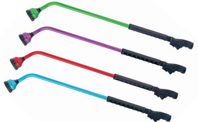
Watering Wands for extending the hose reach to water around the base of plants or high up in hanging baskets with adjustable spray patterns