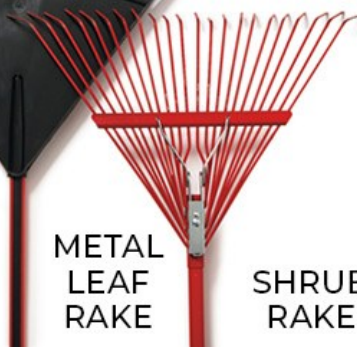
METAL LEAF RAKE