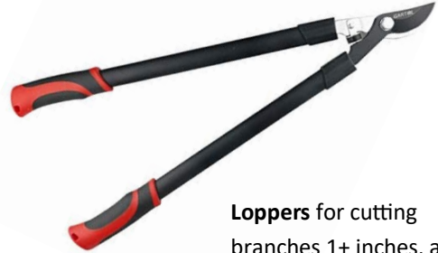
Loppers for cutting branches 1+ inches, avoid dirt contact and moisture, sterilize between uses