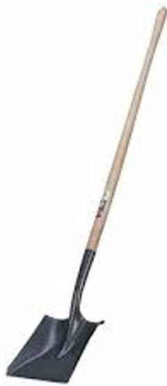
Flat Shovel for scooping soil, bark, or gravel (not digging)