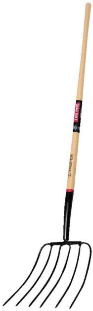
Manure Fork for lifting manure, straw, brush, and wood chips, NOT for use digging or in the dirt