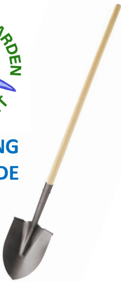
Shovel or "Spade" for digging holes and loosening soil