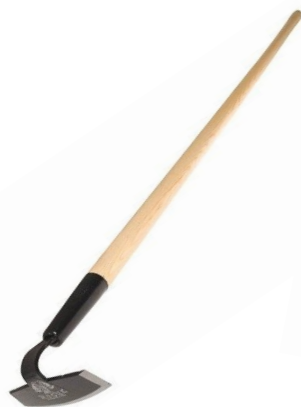
Hoe for removing weeds and turning over soil, NOT digging