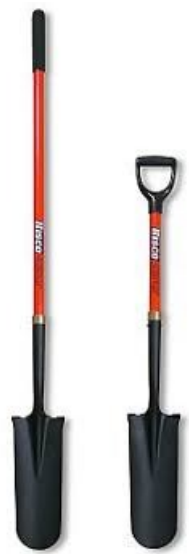
Sharp Shooter Shovels for digging post holes