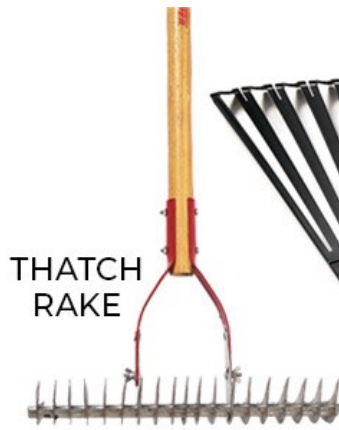
Thatch Rake for removing thatch from lawns