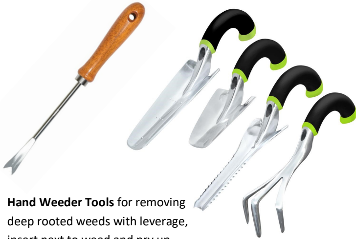
Hand Weeder Tools for removing deep rooted weeds with leverage, insert next to weed and pry up