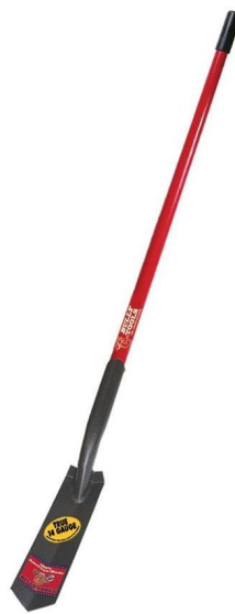
Trench Shovel for digging narrow ditches for utilities