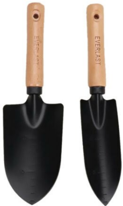
Hand Trowels for digging small holes to plant in, remove weeds, and to transplant small plants